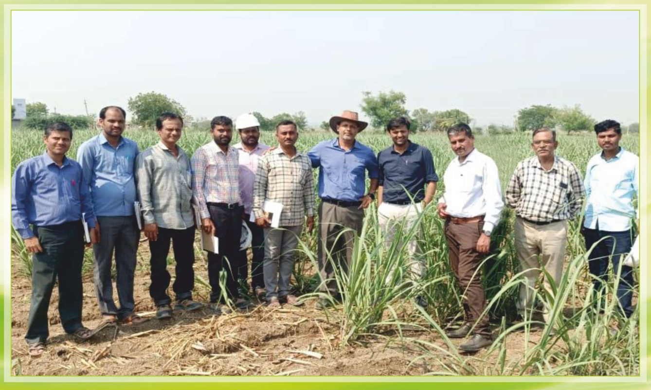
Cane Development Activity at Jewargi Unit